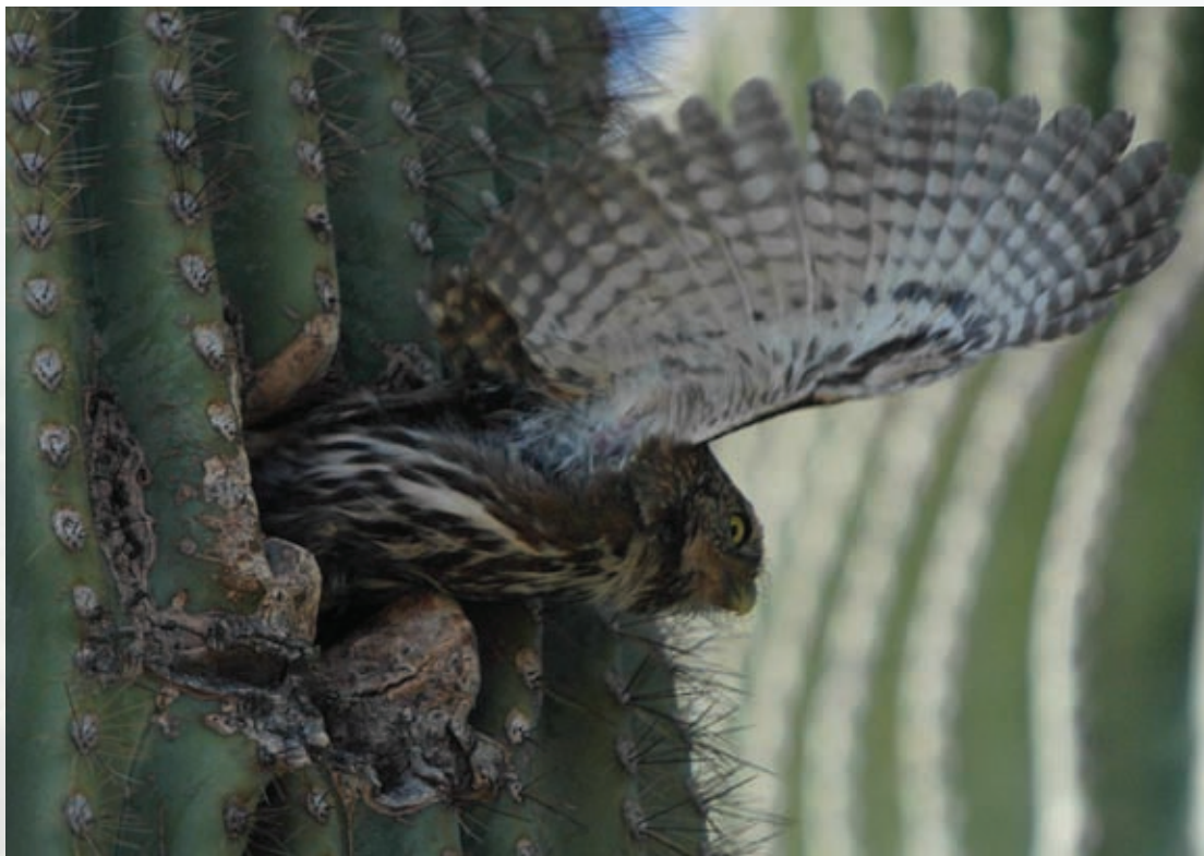
AARON D. FLESCH

For nearly ten years, efforts to protect a small population of Ferruginous Pygmy-Owls near Tucson pitted environmentalists against developers in a heated clash reminiscent of the controversy that surrounded the Spotted Owl in the Pacific Northwest.