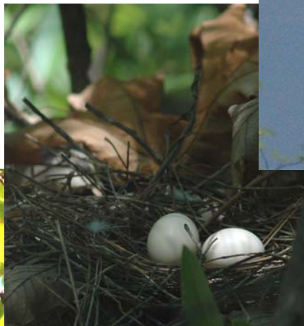
White-tipped Dove nest